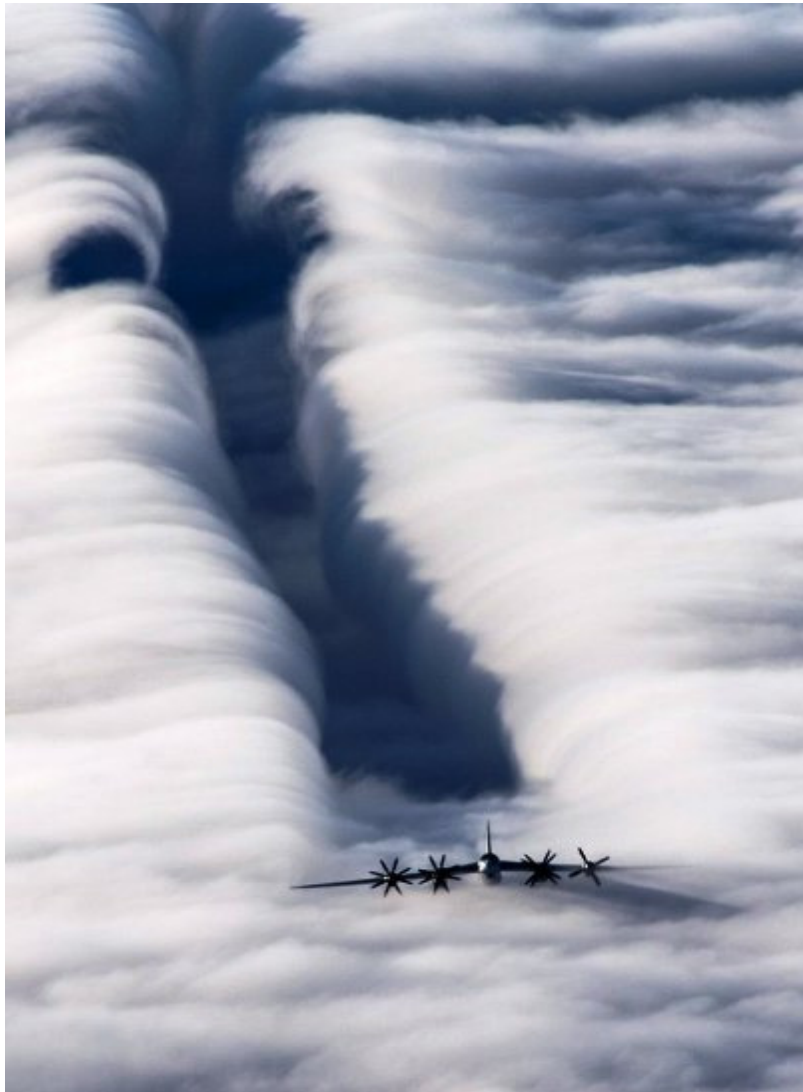
Wings displace air